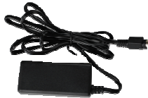
Power Supply (optional)